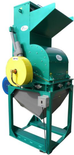
Model 954 H.D.